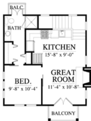
SECOND FLOOR PLAN 479 sq. ft. (heated)