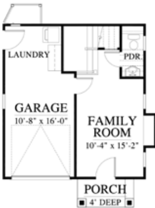
FIRST FLOOR PLAN 288sq. ft. (heated)

909 HSF/1214 TSF, 1 Car Garage, 1 Bedroom, a Loft, 1.5 Baths, Family Room, with a Wood Burning Fireplace